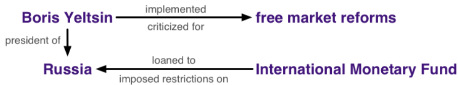
Figure 1: A “concept map” summary of economic forces in 1990s Russia

However, because understanding conclusions from statistical language systems currently requires years of specialized study, many contemporary NLP methods are inaccessible to the journalists, policy makers and social scientists who can make best use of their output. Thus, in my research, I create tools which help non-technical users understand, interpret and make decisions based on statistical language processing. The tools I create, developed in close collaboration with end users such as reporters and editors, synthesize many different NLP methods and make use of a wide range of different machine learning techniques. Many of my projects involve user studies, which examine how well the systems I build actually work.